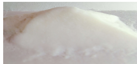
AEROS-N™ Aerogel Powder